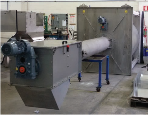
Rotary drum screen