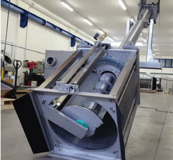
Rotary drum screen with bars