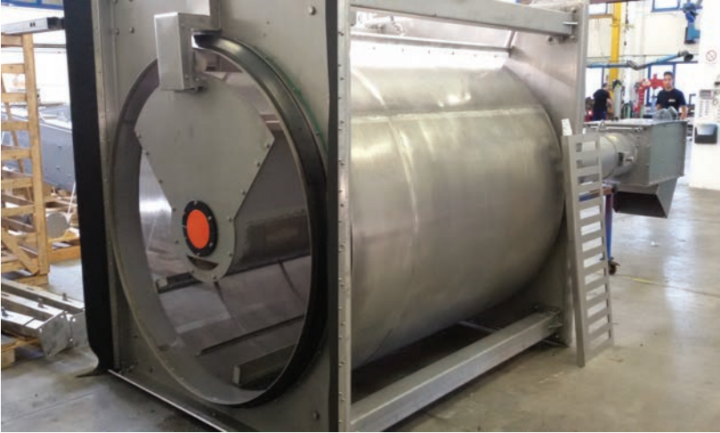
Rotary drum screen