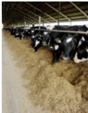
The liquid manure from the stables is used as input material.