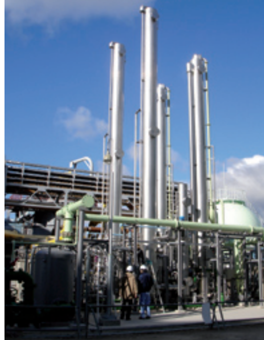
A special process is used to convert the biogas to biomethane.