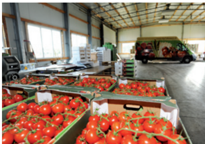
Tomatoes, asparagus and strawberries are temporarily stored in the large hall prior to delivery.

Only renewable raw materials from agriculture and all the liquid manure occurring on the farm are used in both biogas plants. The silage is mixed with the farm's own liquid manure in a 6 m 3 mixing tank and pumped into the fermenter. This gas-tight tank has a net volume of about 2,500 m 3 and is fitted with a heating unit. At a regulated temperature of approx. 37° C, the methane bacteria ferment the substrate into biogas and high quality agricultural fertilizer, the fermentation residue.