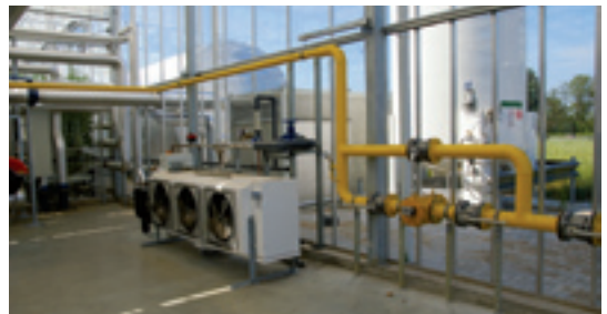
The heating unit provides a consistent climate in the greenhouse.