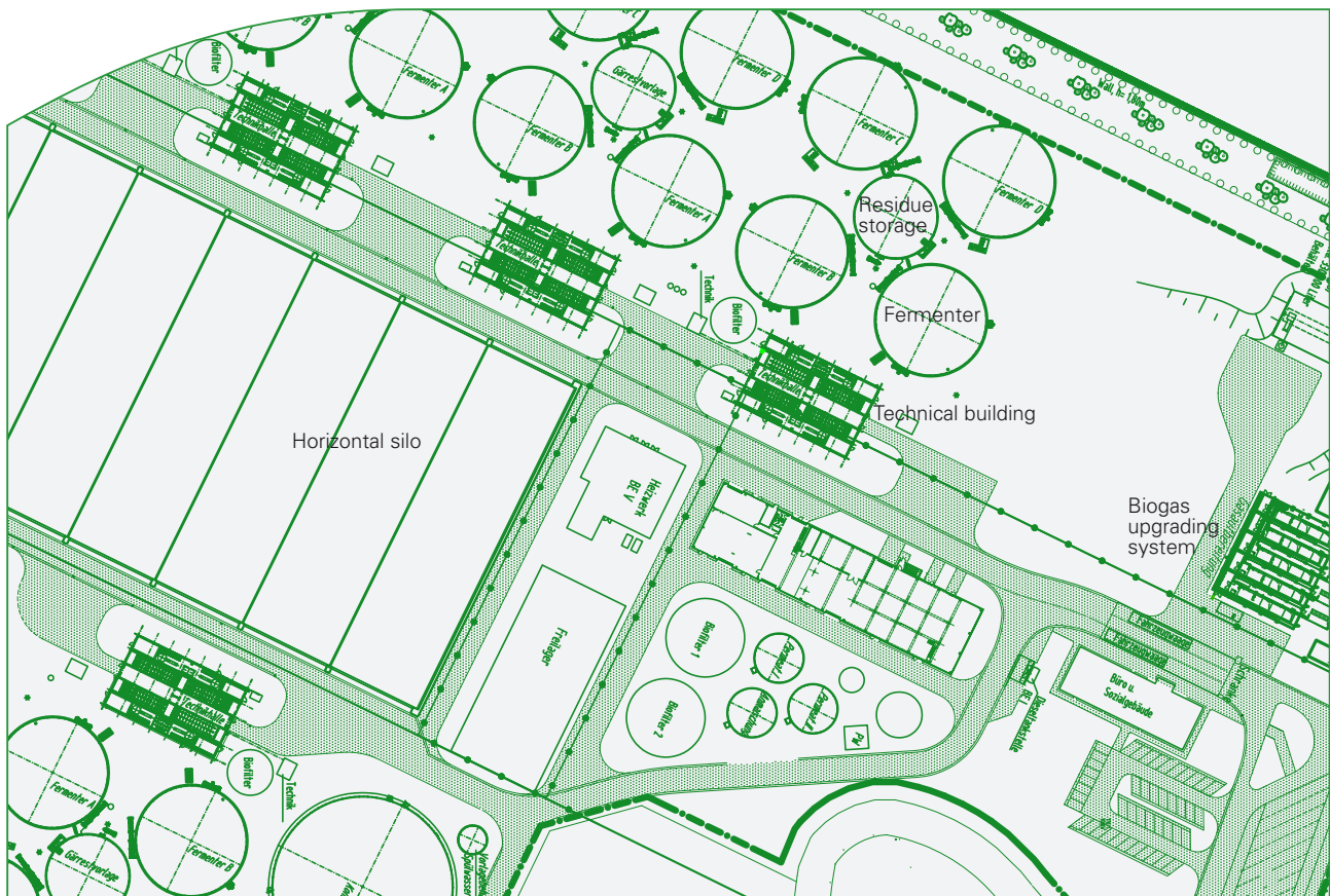
Layout plan of the BioEnergiepark near Güstrow