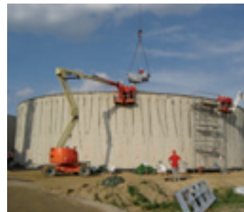
The total bioenergy park spans 20 ha.

It was completed on the very day of German Unity: BioEnergiepark near Güstrow had its topping out ceremony and also half-time following completion of the world's largest plant for the production of natural gas from biogas. Federal Minister Wolfgang Tiefensee also did not want to miss it: