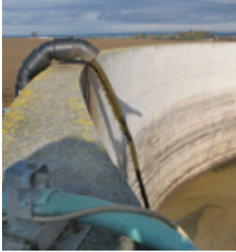
The substrate residues are stored in an open lagoon following fermentation.

When in the winter the children in the primary school and the nursery in Lipa (Czech Republic) listen to the words of their teachers, they will surely have no idea why it is so comfortably warm in their classrooms. It is actually the waste heat from an EnviTec biogas plant that provides this pleasant learning environment as this is fed by the district heating pipeline of the 500-kilowatt plant in Lipa.